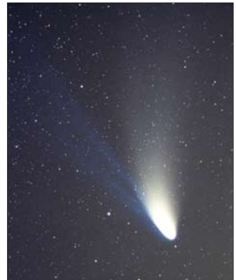
4: The long-period comet C/1995 O1 Hale-Bopp, which swept through the inner solar system in 1997.

Whereas in our two earlier papers we counted the number of collisions on an (inflated) Earth, for the Oort cloud comets a different approach was needed. The orbital period of Oort cloud comets is so great that, even in a 100 Myr simulation, very few close encounters with the Earth would be expected even were the Earth to be greatly inflated. Therefore, in order to directly determine the rate of impacts on the Earth, we would have had to simulate a vast number of test particles, many orders of magnitude higher than that used. This, in turn, would have required an unfeasibly large amount of